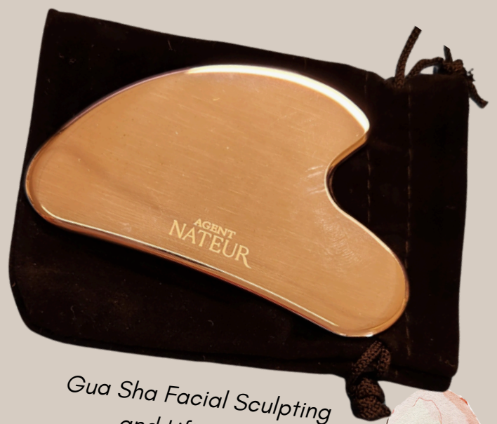
Gua Sha Facial Sculpting and Lifting Tool

Agent Nateur products are the perfect Mother's Day gift for anyone who appreciates high-quality skincare and wellness items. Ideal for skincare enthusiasts, these luxurious formulations are made with natural ingredients, making them great for those seeking effective yet gentle options. They also appeal to health-conscious friends who prioritize clean beauty and wellness, as well as luxury gift seekers looking for sophisticated presents.