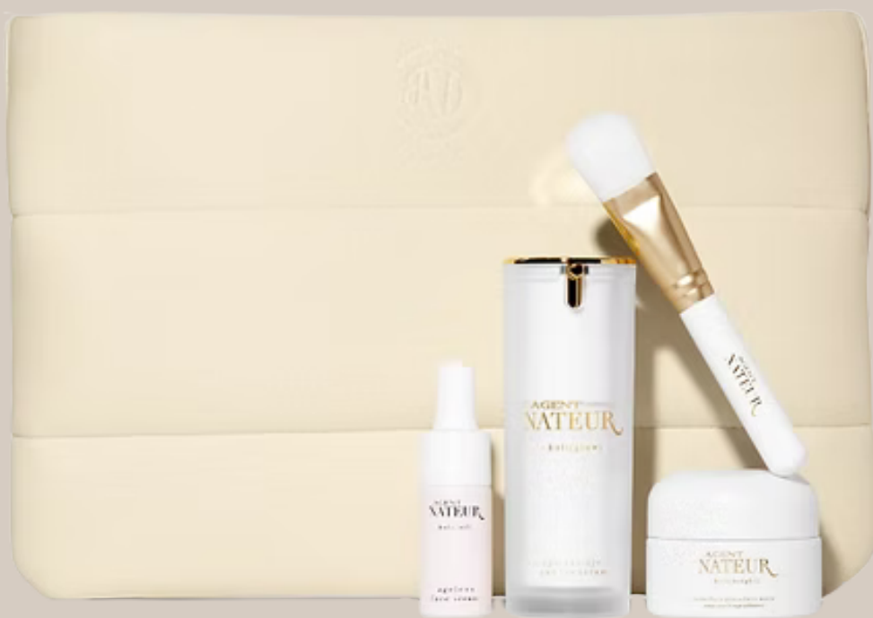
Cream travel bag with full-size Holi (bright) and Holi (glow) with a face mask brush, and a travel-size Holi (oil). A 30% saving

Eco-friendly advocates will appreciate the brand's commitment to sustainability, while busy professionals can benefit from the soothing scents and effective results that help them unwind. Whether for your best friend or your mom, Agent Nateur offers a personal touch that shows you care about their well-being, making these products a wonderful choice for anyone on your gift list—especially those who prefer a simplified beauty routine with multi-tasking essentials.